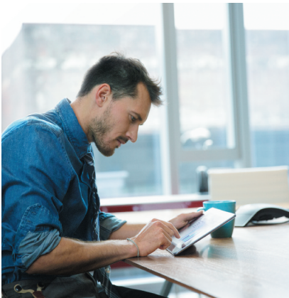
Information und Technik Nordrhein-Westfalen

Landesbetrieb IT.NRW is a pioneer in secure mobile computing with Intel® technology