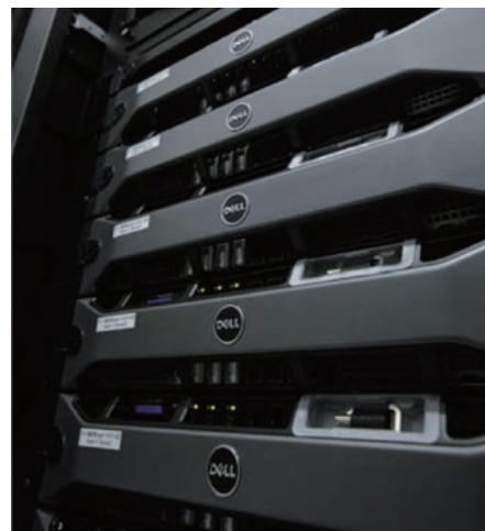
Dell PowerEdge* server with Intel® Xeon® processor

Find the solution that's right for your organization. Contact your Intel representative, visit Intel's Business Success Stories for IT Managers ( www.intel.com/itcasestudies ) or explore the Intel.com IT Center ( www.intel.com/itcenter ).